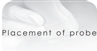
Placement of probe